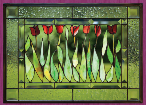
TIMOTHY J. FUSS

Roycroft Power House functions as a visitor's center where periodic demonstrations and workshops are held.